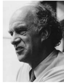
Dankwart Rustow (1924 – 1996)

The emergence of transitology. As a research area, transitology originated in political science. Its founder was the American political scientist Dankwart Rustow, whose article “Transitions to Democracy – Toward a Dynamic Model” determined the title of this scientific area. By focusing on internal factors of transition (the ability of political elites to perform a series of sequential procedures necessary for institutionalizing democracy) and rescinding from its external factors (level of economic development, social class structure of society, etc.), Rustow laid foundations of a procedural approach to the study of political transits, which was the basis of the primary transitological paradigm. The transitological paradigm was described in detail by Guillermo O’Donnell and Philippe Schmitter in “Transitions from Authoritarian Rule: Tentative Conclusions about Uncertain Democracies” (1986), where the transitions to democracy were represented as a process of consistent institutionalization of political change with are three regular stages in its development: liberalization, democratization and socialization (fig.1).