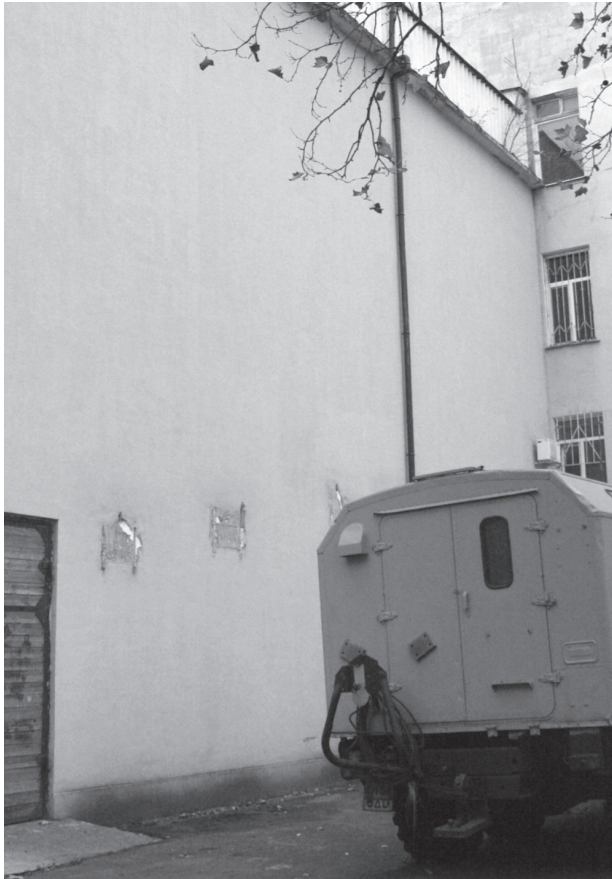
Picture 6. Cinema hall at Odesa film studio

studio, a room for rehearsals, a camera room, and a cinema hall with 320 seats ( picture 6 ). While the current arrangement of the administrative block in the building corresponds with modern trends, this is not true about the equipment for filming itself; e.g. one can see insufficient capacities for lighting and automation in pavilions. However, as this kind of problems have been non-architectural by nature, they will not be considered in detail in this article.