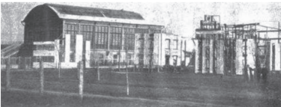
Picture 1. The First Pavilion at Haritonov studio (now Odesa film studio) ( Гарин 7 )

This was the practice lasting until the collapse of the Soviet Union in 1991 and Ukrainian indepen-