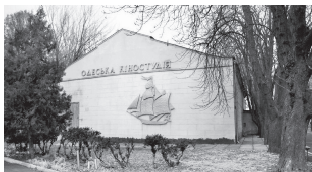
Picture 3. Third pavilion at Odesa film studio ( http://www.odesafilmstudio.com.ua/ )