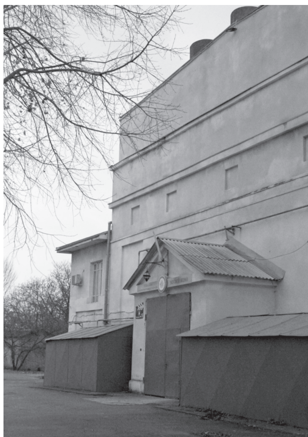
Picture 4. Fifth pavilion at Odesa film studio

dence as a result. Through the first two decades of the independence, governmental orders for film production had not been actually practiced in Ukraine, while the studios themselves proved to be unsuitable for commercial film production, the situation which led to a partial decline of the industry. Currently, the situation is getting better, but there is still a lot of room for improvement. Over time, studios began to adjust themselves to market realities, activating affordable methods of earning money. To date, their content has partially changed.