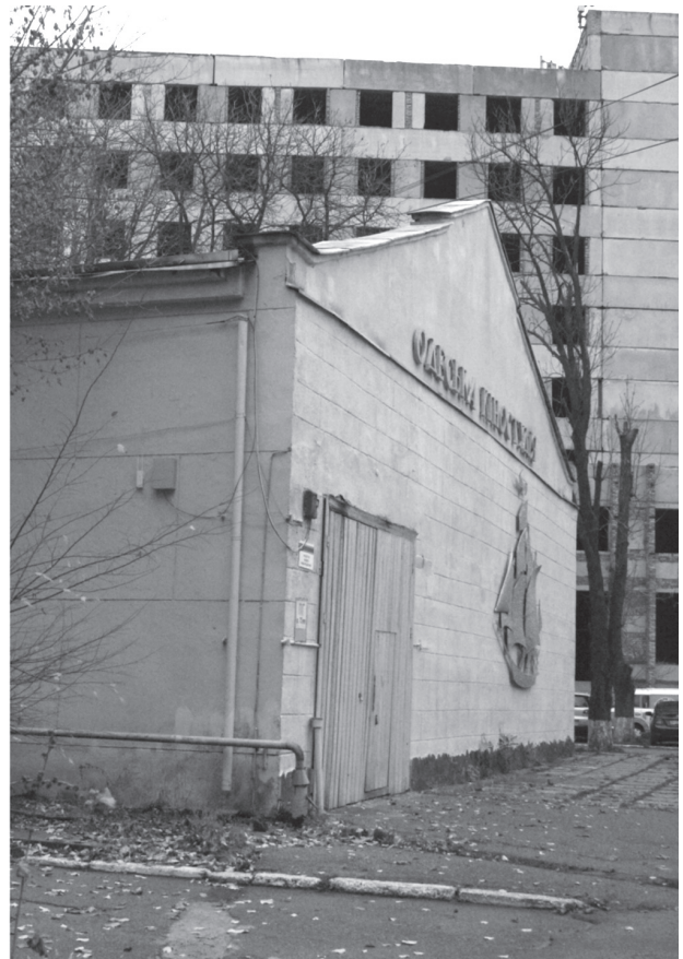
Picture 8. Unfinished new administrative building at Odesa film studio

In 1980 th , construction of a new administrative building began ( picture 8 ) as a part of a new project. The project, ultimately suspended in 1990 th , also provided for construction of an additional filming pavilion.