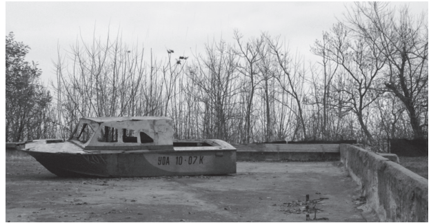
Picture 7. Zone for water scenes at Odesa film studio

The main advantage of the pool at Odesa Film Studio was that it coincided with the horizontal level of the sea, located just beyond the boundary of the studio. So, we can conclude that creation of street scenery had been quite developed skills at Ukrainian film studios.