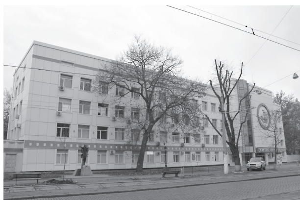
Picture 5. The main administrative building at Odesa film studio

The main administrative building ( picture 5 ) has been the location not only for administrative office, but also for a museum, the sound editing unit of the